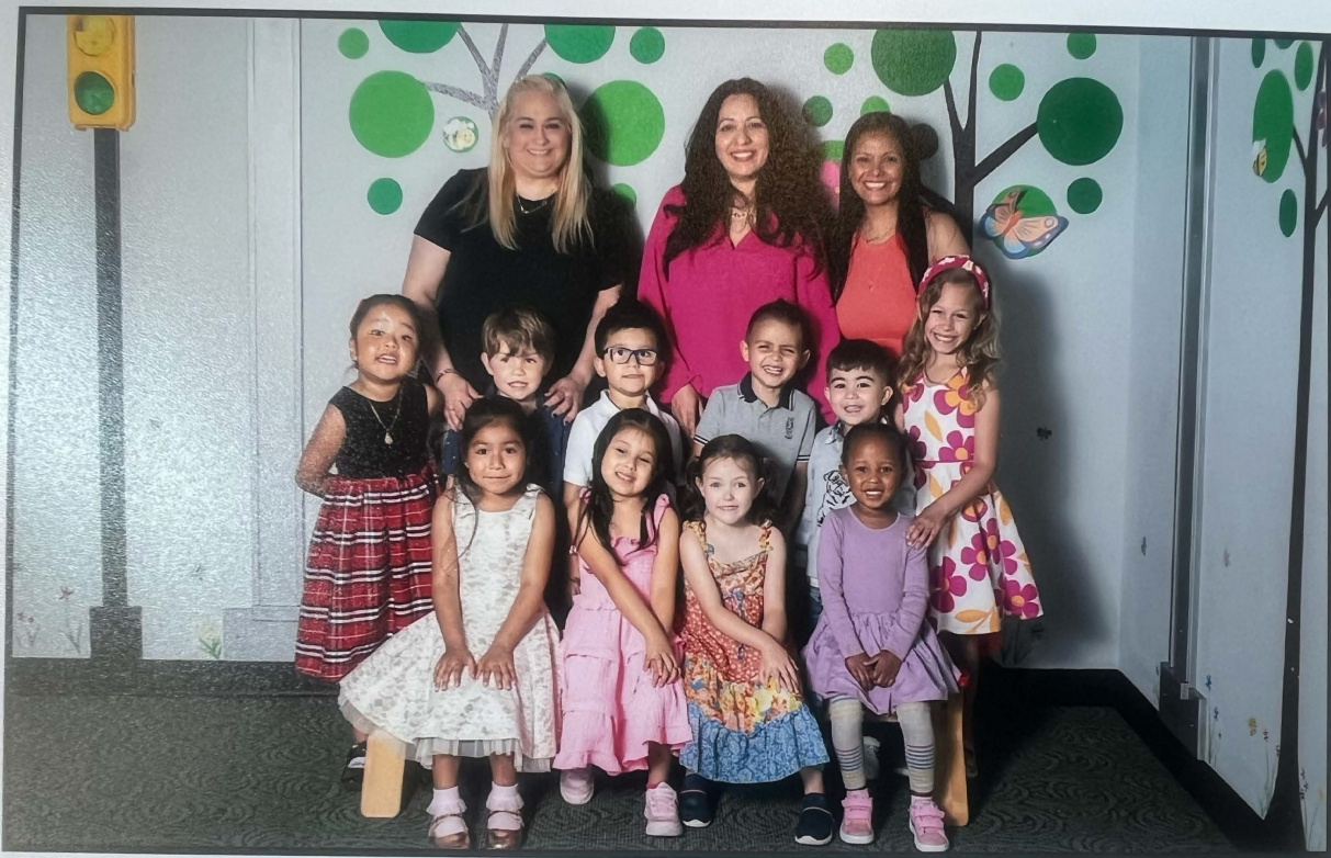
Spanish for Niños Bilingual Preschool